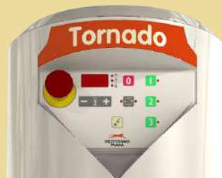
Electronic control 3 speeds (EL)