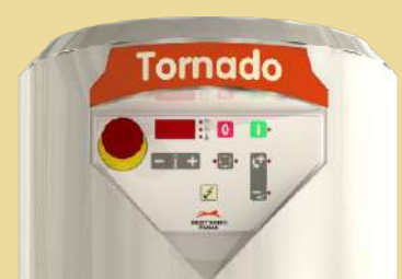
Electronic control speed variator (VRV)