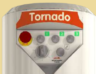
Electromechanical control (EM)